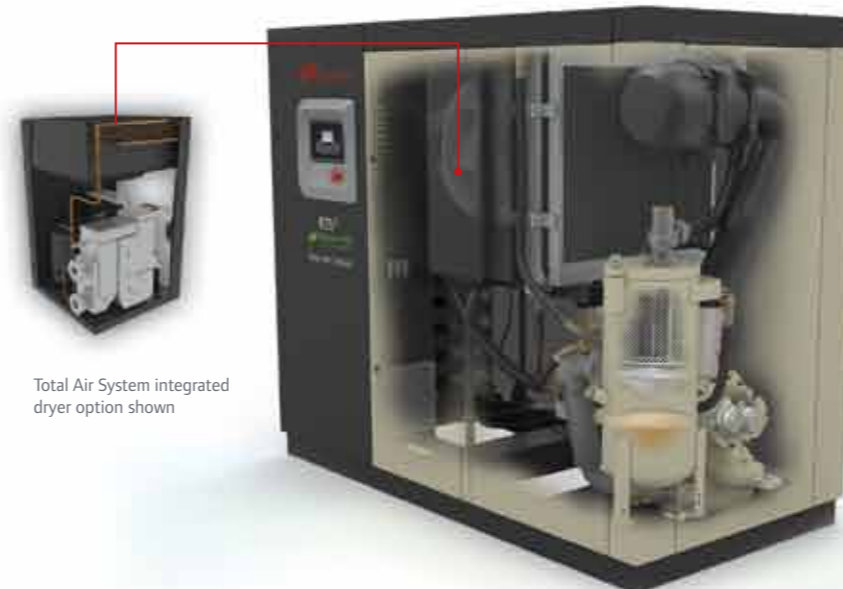
Total Air System integrated dryer option shown