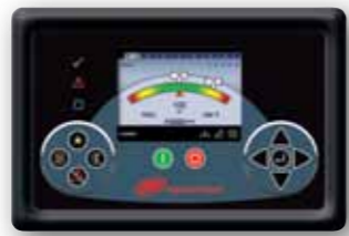
Xe-145M option shown

Ingersoll Rand R-Series rotary screw air compressors offer the very best of time-proven designs and technologies with new, advanced features to ensure the highest levels of reliability, efficiency and productivity available.